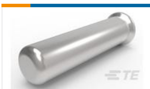
TE Part # 50462-8 SOCKET,MIN-SPR SN-AU SER-2